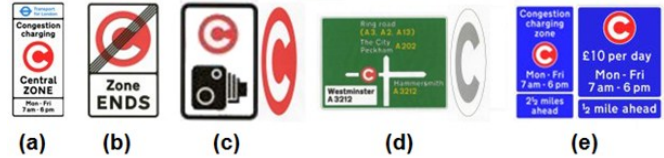
Figure 2. LCC signs [1]

the zone are located at all exit points (b). Within the zone, red "C" markings and signs reminding drivers that they have to pay the charge (c) are often placed close to entry points. Directional signs and/or road markings indicate which routes take drivers into the zone and which do not on approach to a junction, and some lanes leading to the zone are marked with a white "C" symbol (d). Finally, advance information is provided on the main approach roads at various distances from the zone, reminding the drivers of the hours of operation and of the amount they have to pay (e).