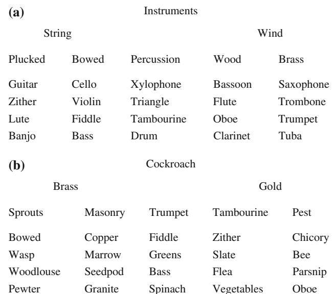
Fig. 1 Examples of conceptually organised (a) and randomly organised (b) hierarchical presentation of words

Following Bower et al. (1969), the experimental materials for the current study consisted of two sets (Set A and Set B) of four conceptual hierarchies, which were generated by representing the hierarchical nature of conceptual categories in the form of hierarchical trees. An example of one of these trees is shown in Fig. 1. As illustrated in this example, each hierarchy consisted of 4 levels of category specificity. Level 1 always consisted of a single superordinate category label, which included minerals, instruments, vegetables and insects for Set A and buildings, plants, arts and industries for Set B. Levels 2 and 3 represented category labels of increasing specificity and Level 4 consisted of exemplars for each of the Level 3 categories. Although the precise structure of the different hierarchical trees varied somewhat, each hierarchy included five sets of category exemplars at Level 4. All but one of the categories consisted of 28 words in total with the remaining category (i.e. Insects) consisting of 27 words. Thus in total Set A consisted of 111 words, whilst Set B consisted of 112 words.