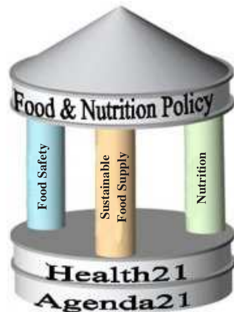
Figure 1: The Three Pillars supporting healthy food and nutrition policies

The three pillars of nutrition, food safety and environment (sustainable food supply) were developed by WHO as guides for national governments for the achievement of national health and nutrition plans in line with the provisions of the International Conference on Nutrition (WHO/FAO, 1992).